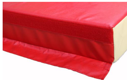
Joining hook and loop fastening system

Note: Do not use the foam parallel bars without the upper modules