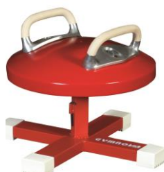
Ref. 3581 + 3584