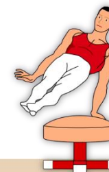
Learning the closed legs circle