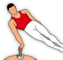
Learning the facial circle on 1 pommel