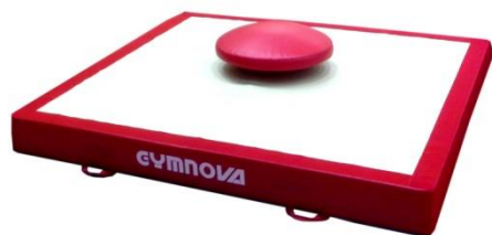
Ref. 1399 + 3581

Ref. 1399: 200 x 200 x 20 cm (Lxwxth.) mat specific to the “mushroom” Ref. 3581 with central opening and cut-out for the pedestal