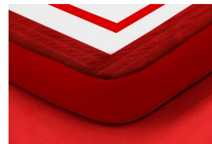
Integrated hook and loop straps