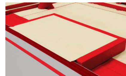
Edge hook and loop