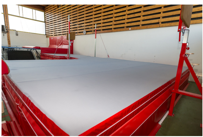
Raised pit - Ref. 7097