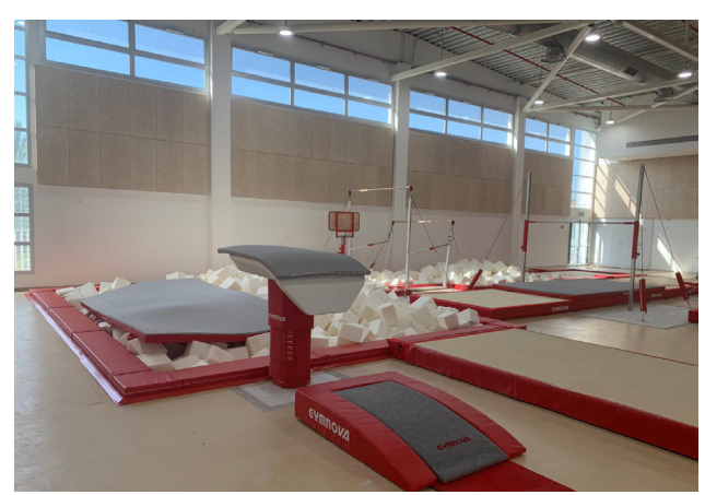
Sunken landing pit with foam cubes - Ref. 7194