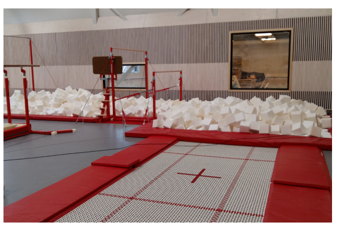
Landing pit with foam cubes and trampoline junction - Ref. 7194