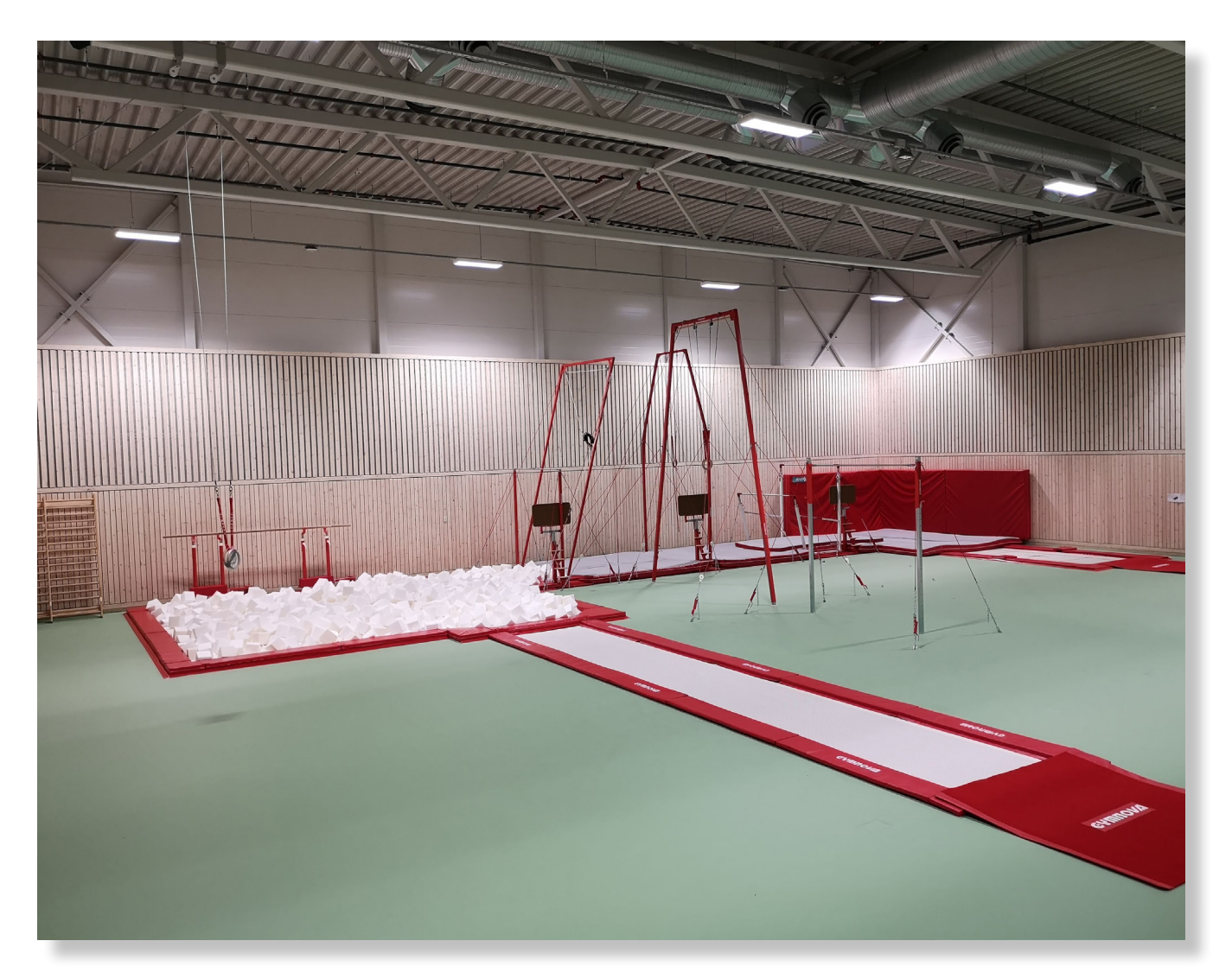
Construction of a combined pit: full built-in landing pit and sunken landing pit with foam cubes.