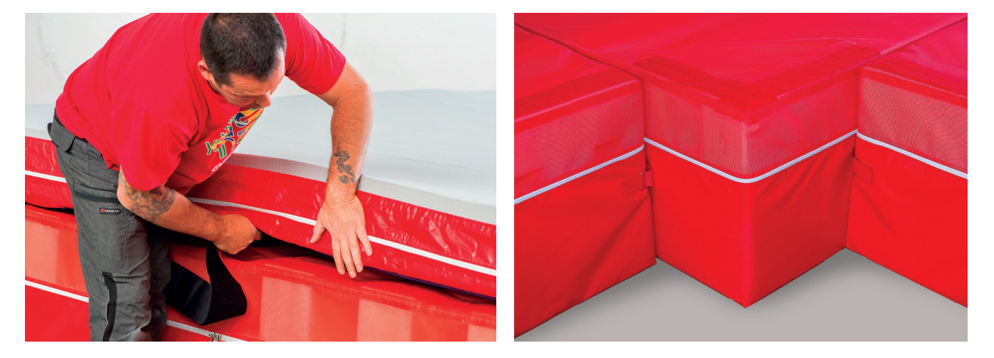
It is also possible to use this type of pit on a podium for ground and vault landings.