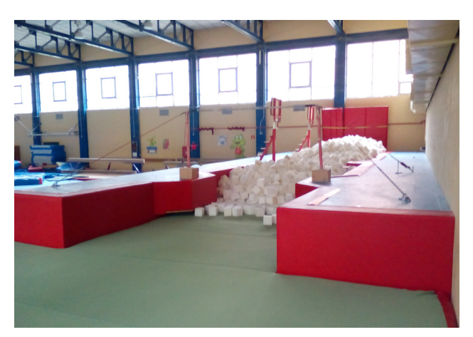
Landing pit with integrated platform - Ref. 7194