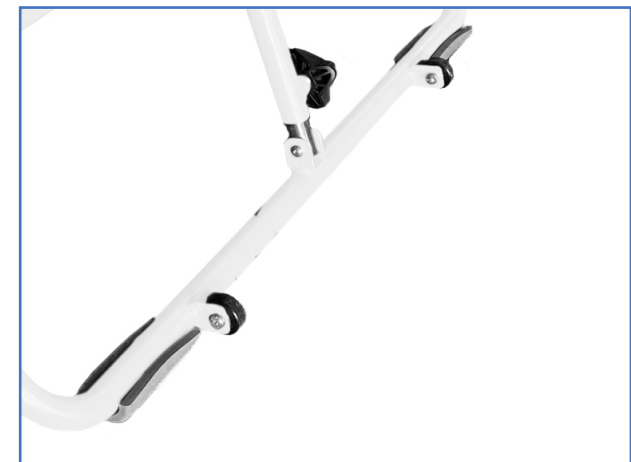
Moving castors, anti-sliding rubber feet and easy handles adjustment