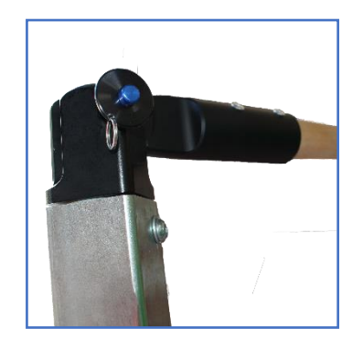
Hand-rail attachment pins