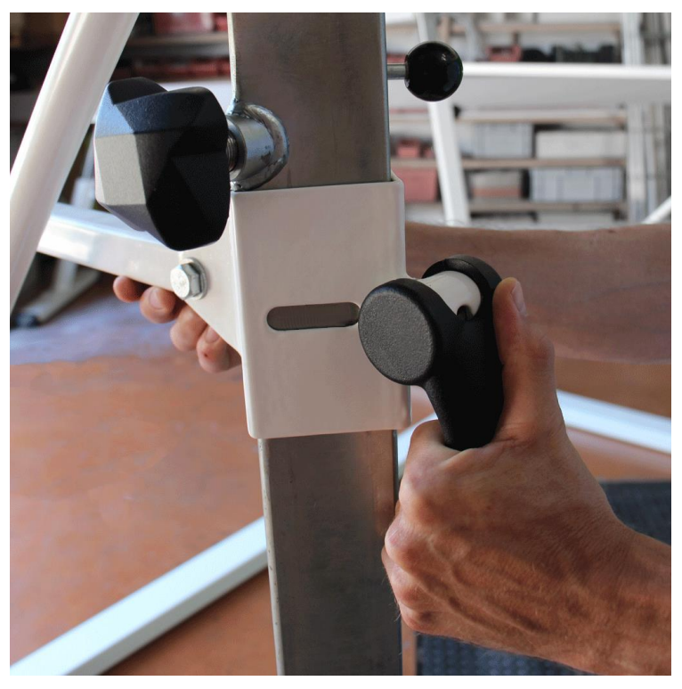
Easy and quick height adjustment