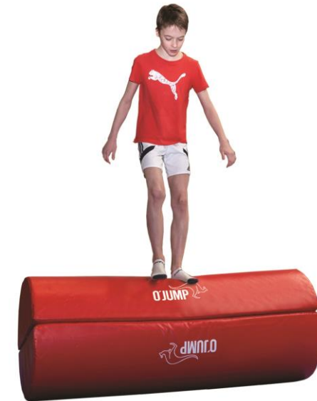
Ref. 066 x 2