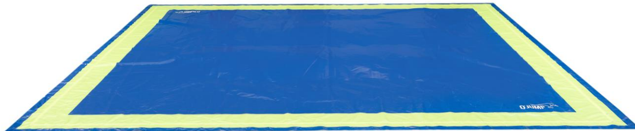
2- Judo markings