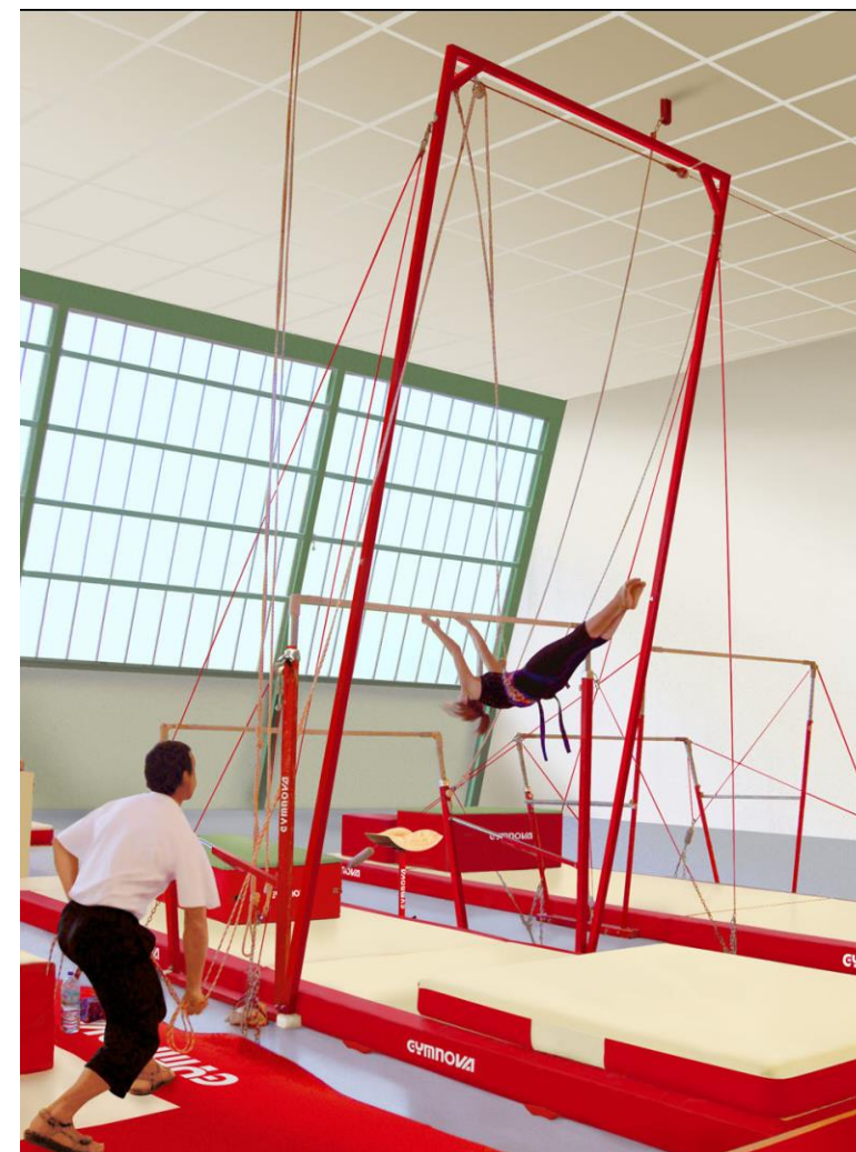
Spotting frame for training on asymmetric bars