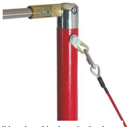
Solid steel machined rotating heads