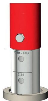
Adjustable feet in height